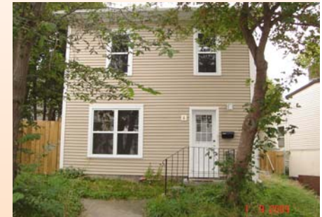
PHRP—Before and After