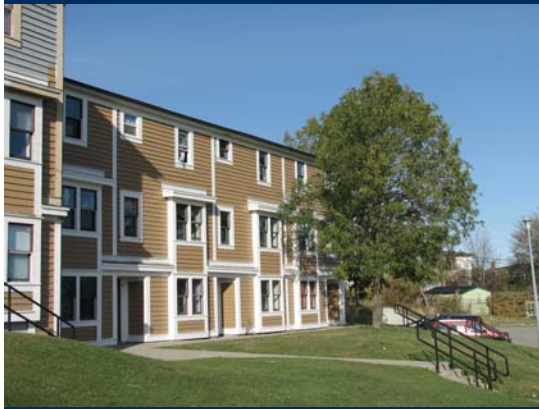
Buckmasters Circle, St. John's