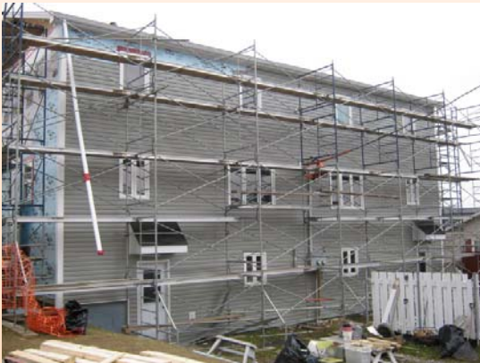
Modernization and Improvement Woodbine Avenue, Corner Brook

M&I work includes planned retrofit of the building envelope (windows, doors, siding, etc.), as well as kitchens and bathrooms, etc.